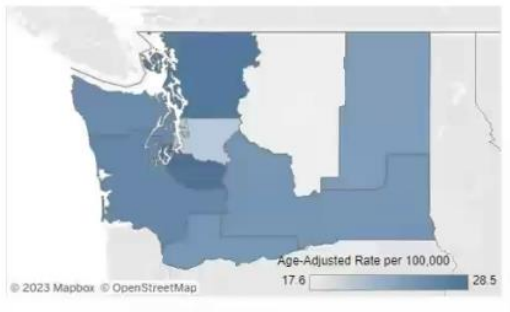
Washington East Region-2020 Drug Induced Death Rate 24.1 Per 100,000

/www.cdc.gov/nchs/pressroom/sosmap/suicide-mortality/suicide.htm